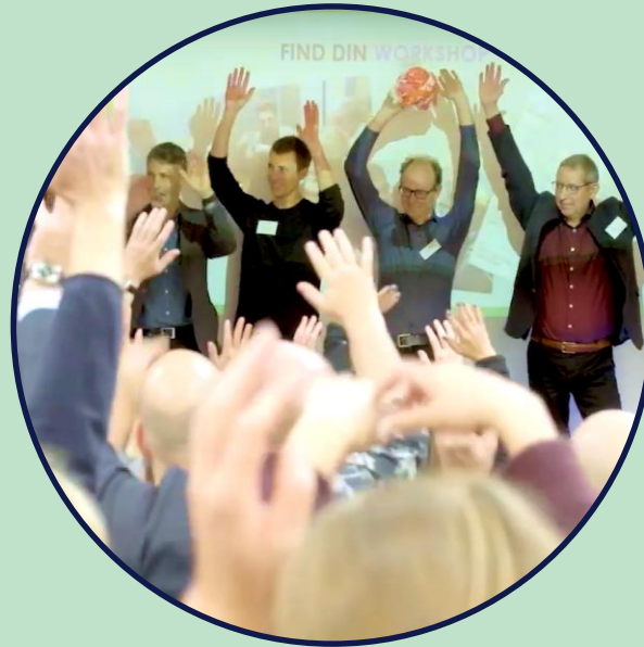
COchallenge workshop 10.10.19