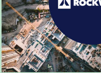
Read about the COchallenge HERE