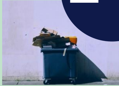
Read about the COchallenge HERE