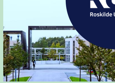
Read about the COchallenge HERE