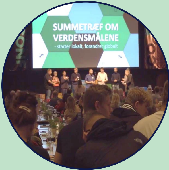
Kick-off: Meeting about the Globe Goals 10.09.19