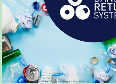
Read about the COchallenge HERE