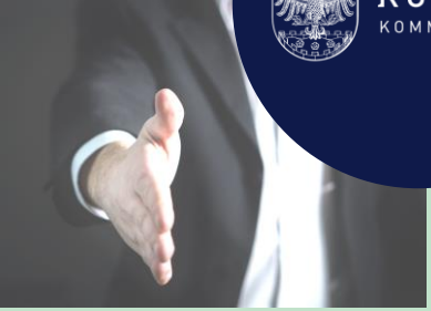
Read about the COchallenge HERE