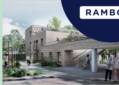
Read about the COchallenge HERE